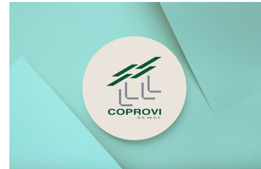
Logo, building Company. Mexico City, 1991.