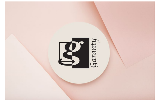
Logo, Publicity Agency. Mexico City, 1991.