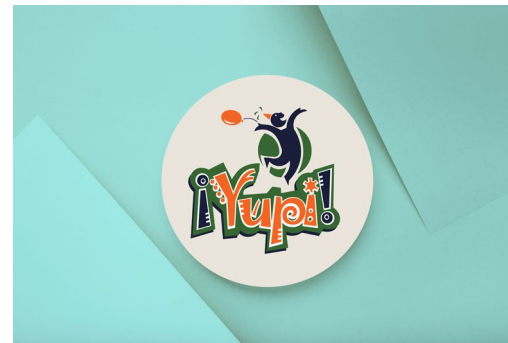
Logo, Party articles boutique. Toluca, Mexico, 1991.