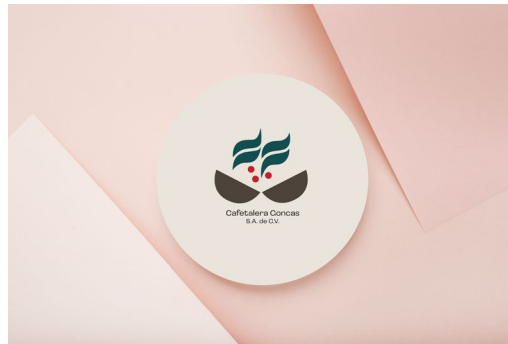
Logo, coffee manufacturer Company. Chiapas, Mexico, 1992.